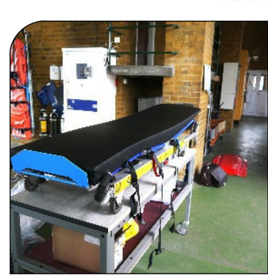
TT-Transporter™ - is a mattress that provides a flat surface on the Alfatrolley, during transports with TraumaTransfer™