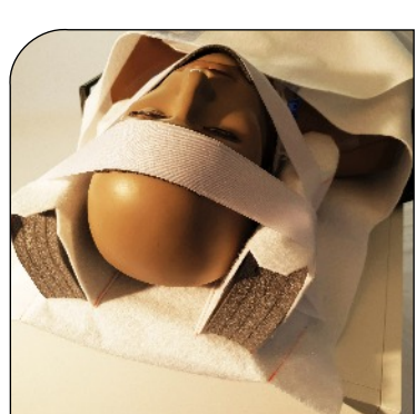
TI Harding COLATIN Dispussible has

separate soft/hard head-cushion for TraumaTransfer™. Keeps the patient warm and protects the mattress. It is designed for optimum tensile