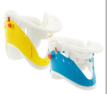
AEROresc® - EASY Collar combines the best from the market leaders in collars. EASY Collar can be adjusted to 16 sizes, to obtain full adaption. Comes in an adult, military and paediatric version. Certified for use . with TraumaTransfer™

\textbf{Pelfix}^{\intercal \textbf{M}} \ \textbf{Pelvic fixation} - \textbf{Set of} cushions designed to prevent sideways sliding. Set with two large and two small cushions for different sizes of patients.